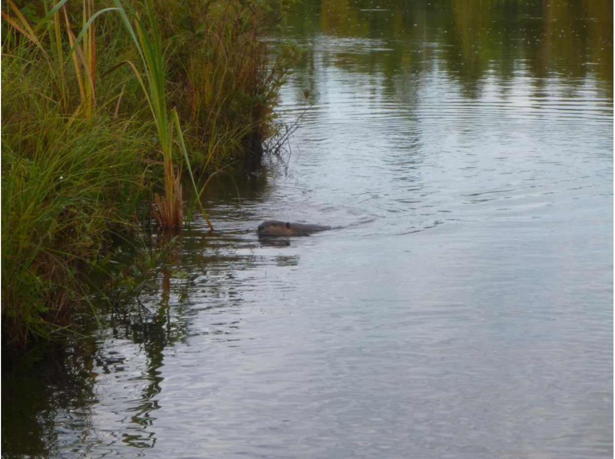
Figure 41. Muskrat swimming along the shore of Grass River during data collection.