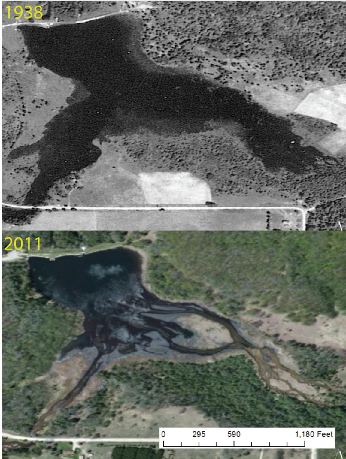
Figure 43. Comparison of aerial and satellite imagery from 1938 and 2011 of Rugg Pond.